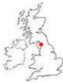
Figure A.2.5 Victorian Industrial Town