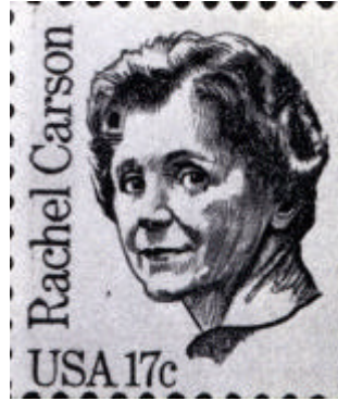
Rachel Carson Postage Stamp (1981)

Operational Integrity Management (OIM) systems have developed and grown over a period of many years — often in response to events and incidents that made companies, government agencies and the general public decide that “something must be done”. This chapter describes just a few of the key events of the last 150 years or so that have contributed toward the development of OIM principles and programs. Most of the events discussed here are dramatic accidents that had large safety, environmental and economic consequences. However some of the “events”, such as the publication of Rachel Carson’s book Silent Spring in the year 1962, stimulated changes in perceptions and attitudes with regard to safety and environmental issues. Other “events” included introduction of seminal regulations, such as OSHA’s Process Safety Management standard in the year 1992.