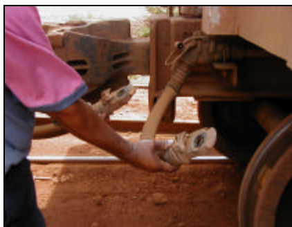
Figure A.2.3 Uncoupling Railcars

Not only were industrial safety standards up until the end of the nineteenth century very low, equally little attention was paid to environmental issues, as illustrated by the following quotation from Charles Dickens' novel Hard Times (written in the year 1854):