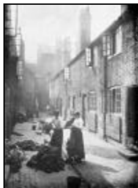
Figure A.2.2 Victorian Slum Housing

In the early phases of the industrial revolution (up to the middle of the 19 th century), health, safety and environmental issues did not much concern industrialists, investors or governments. Consequently, industry's safety and environmental record in those days was often appalling. Toward the end of the 19 th century public reaction to this state of affairs led to the introduction of the basic occupational safety and environmental regulations and standards. It was during the same time period that other basic reforms, such as child labor laws, were enacted.